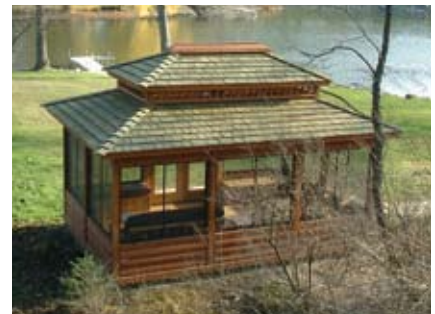
12' x 18' Summerhouse - $23,650