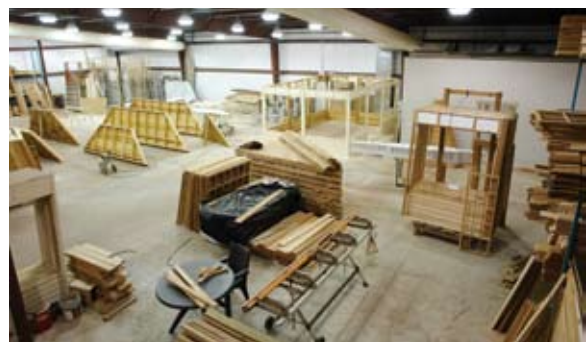
The climate controlled building includes a paint area where paint and stain are applied for a quality finish.