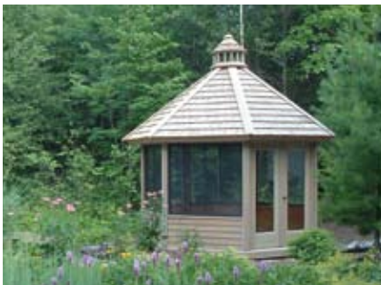
12' Three-Season - $14,950