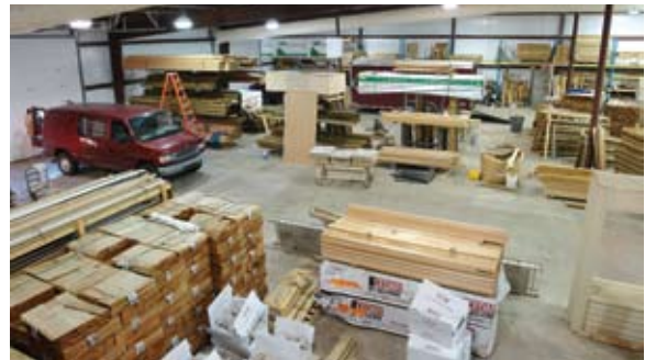
A portion of the newest addition to the facility is used for storage and shipping.