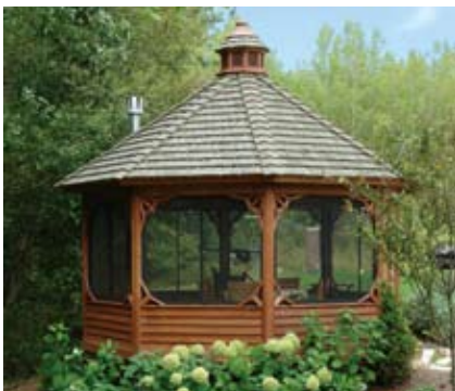
16' Three-Season - $19,600