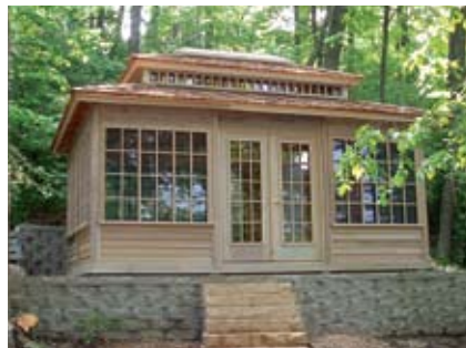
12' x 18' Summerhouse - $24,850