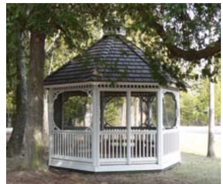
12' Traditional - $14,100