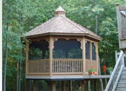
14' Traditional - $16,100