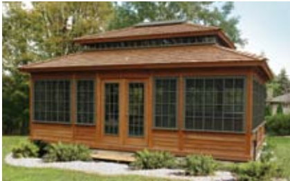
18' x 24' Summerhouse - $46,180