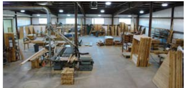
The 10,000 square foot production area is where each gazebo begins.

If you are in the area, we invite you to stop by and tour our facility and visit our gazebo displays.