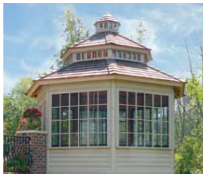
14' Three-Season - $18,940