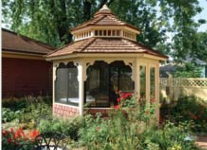
12' Three-Season - $16,950