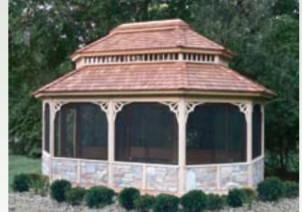
14'6" x 20'6" Oval Summerhouse - $31,200