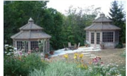
16' Three-Season - $24,960 each