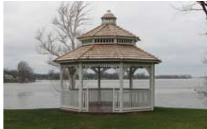
16' Traditional - $14,700